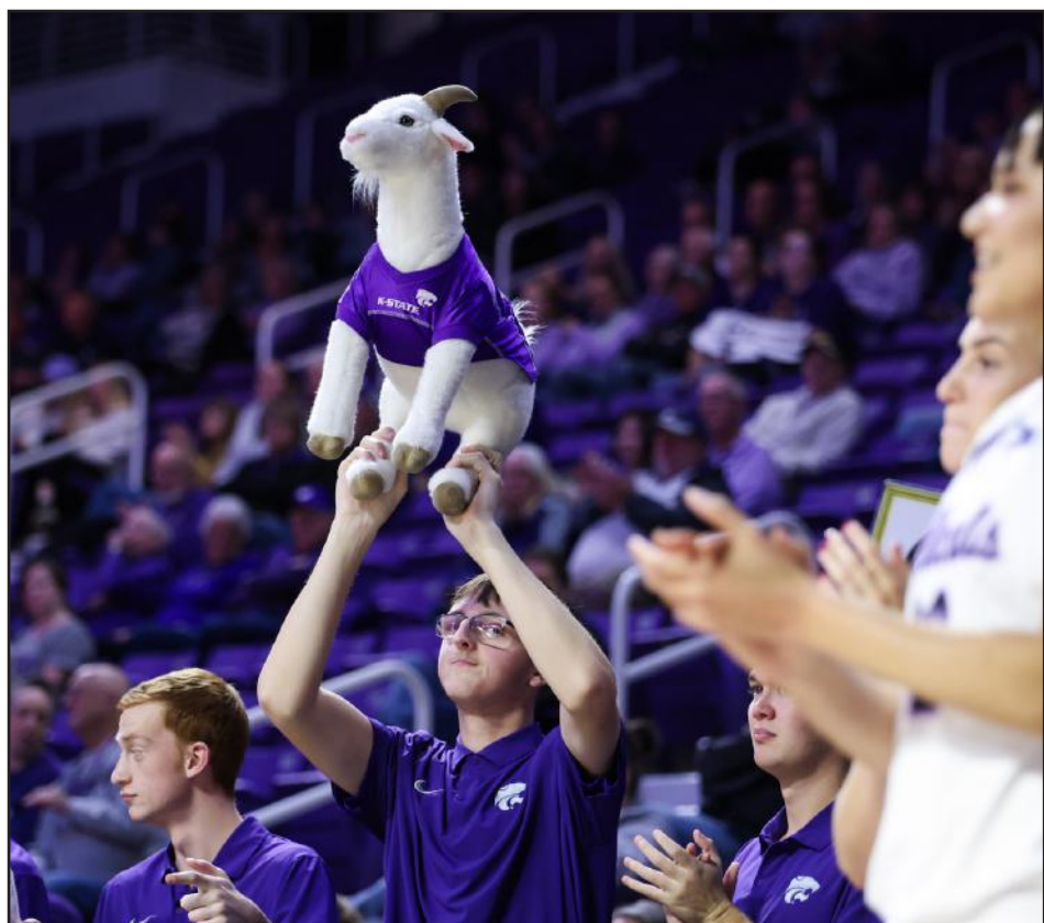
Gap Goat is lifted by K-State women's basketball managers (masters_of_management on Instagram) during the Wildcats win over Eastern Illinois. The K-State defense allowed 43 points.